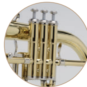
155 Model with 2 triggers