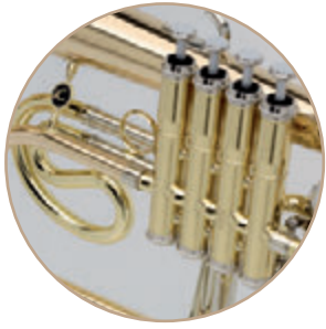
156 Model with 4 valves