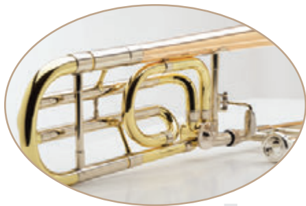
Circuit de Fa